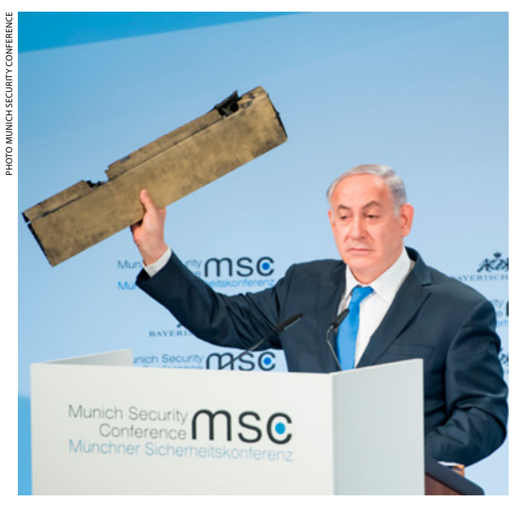
Underlining the Iranian threat, at the Munich Security Conference (2018) Netanyahu held up a fragment of a shot down Iranian drone

The military leadership of the Islamic Revolution Guard Corps (IRGC) used language in line with Khamenei. In November 2017, for example, IRGC-general Qassim Soleimani wrote a public letter to the Supreme Leader on the event of the 'defeat of ISIS', when Iranian supported militias drove ISIS from a Syrian-Iraqi border town. Soleimani's wording partly reflected the Supreme Leader's use of language (e.g. 'poison of Zionism' and 'dark and dangerous conspiracy'). <sup>13</sup> Khamenei replied with a similar public letter of his own. Another