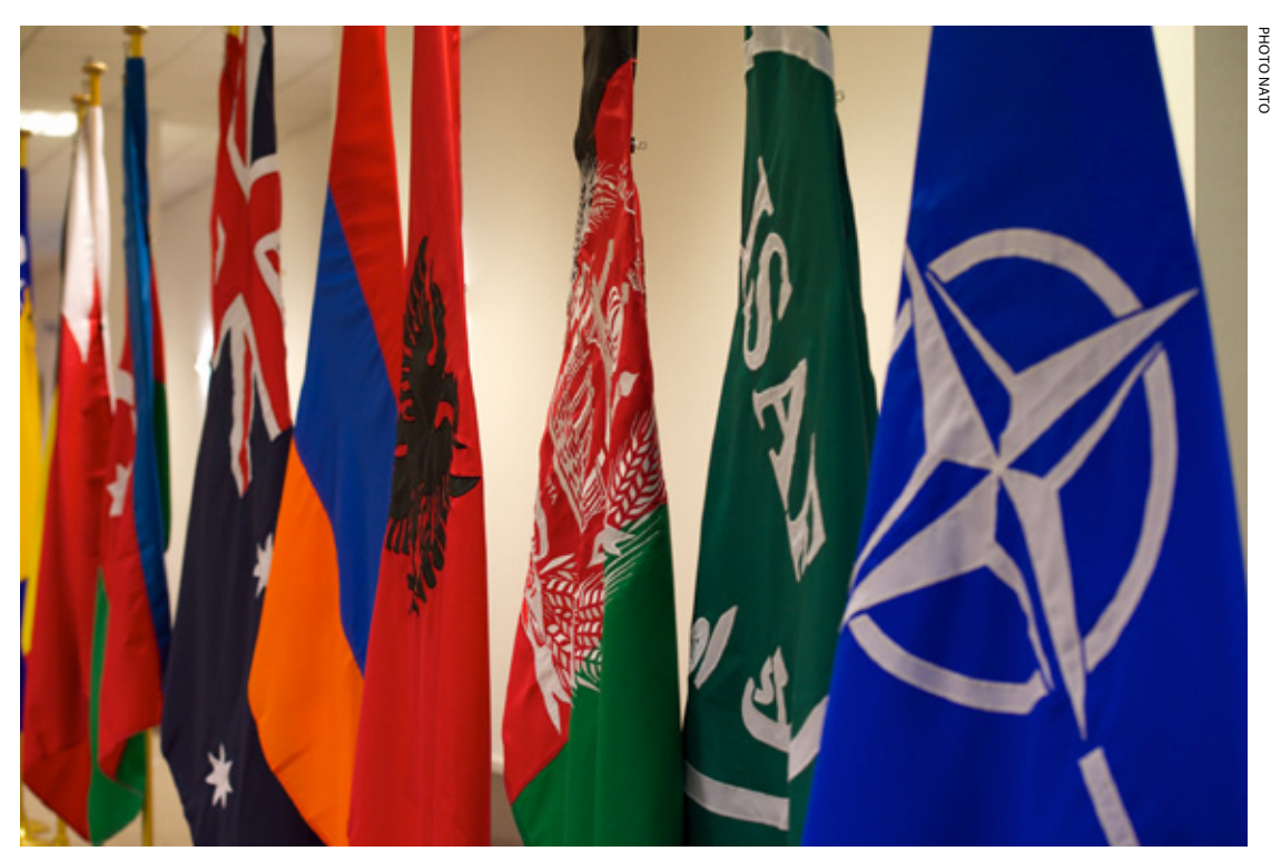
Flags of NATO and its member states. Given that most military operations are multinational in nature it would be interesting to, for example, consider differences between problem definitions and political mandates of the various contributors

Given that most military operations are multinational in nature, and sometimes exist in parallel to other combat, peace keeping or stability operations, it will be interesting to consider differences between political mandates of the various contributors, underlying definitions of the 'problem', and experiences on the ground. For example, in Afghanistan, how have policies and actions by the International Security Assistance Force (ISAF), the US-led Operation Enduring Freedom, the Afghan government, the Taliban, or numerous other groups varied and related?<sup>19</sup> How united are the Taliban? Or for Mali; what is the multi-consequentiality of statements and actions related to the French counterterrorism operation Barkhane, the Malian interim government, the Tuareg and various other peace deal signatories or local groups, and the narratives of contributors to the United Nations Multidimensional Integrated Stabilization Mission in Mali (MINUSMA)?<sup>20</sup> Rather than defining or finding 'the truth'