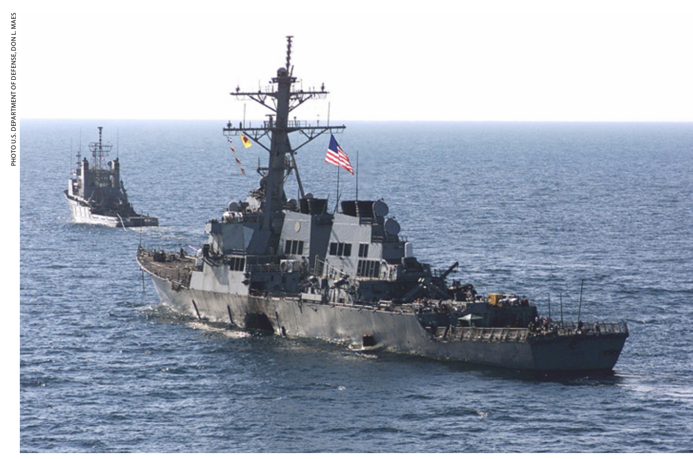
The USS Cole is towed away from Aden into the open sea, after al-Qaida attacked the ship in October 2000