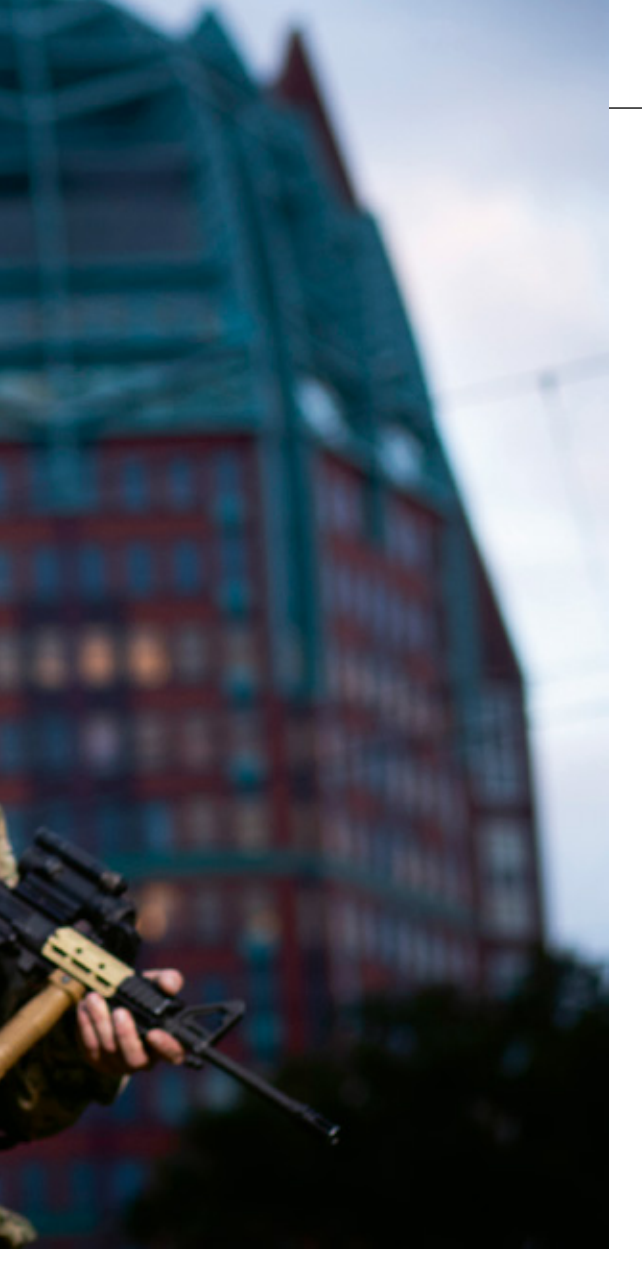
A long list of military-strategic challenges was used to create eleven future conflict scenarios