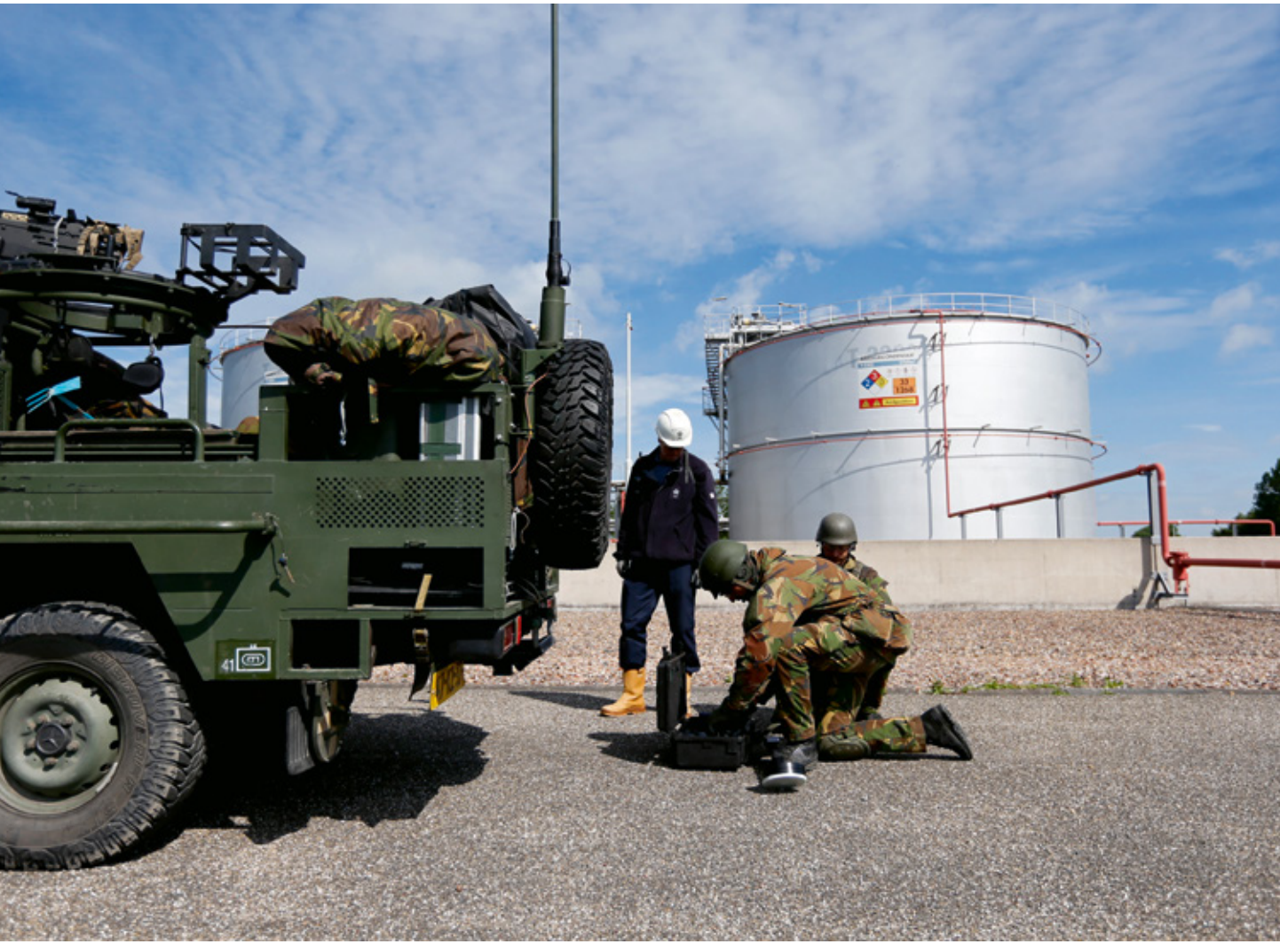
Armed forces have unique core competencies in enhancing security, which is fundamental for economic and social progress