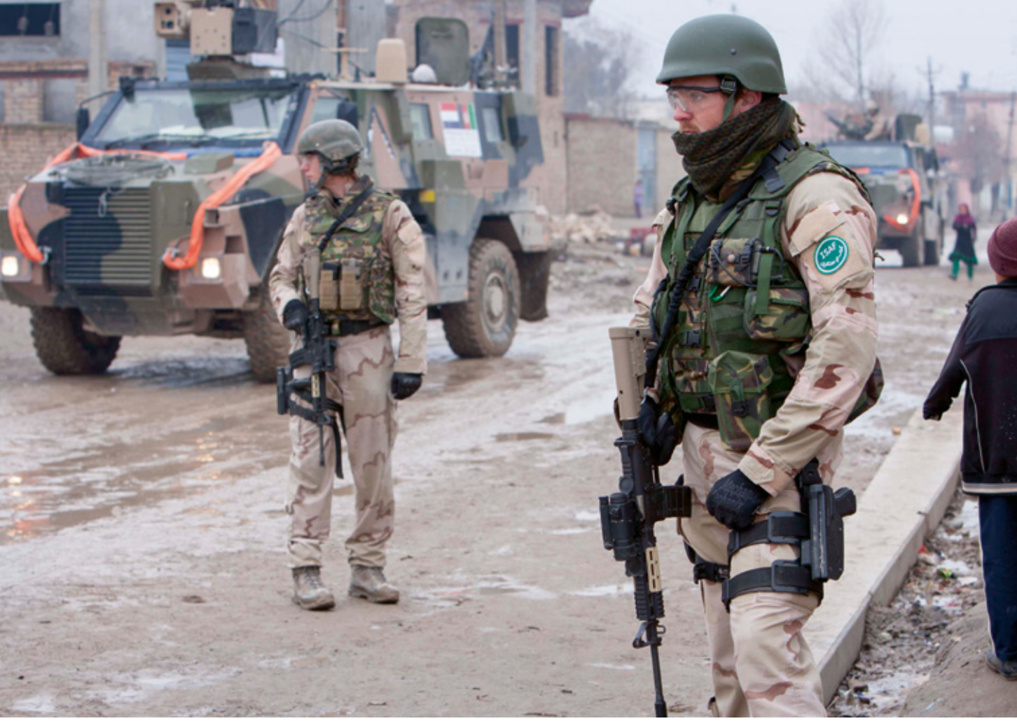
Gathering information during a patrol: Over the next decade, information will become the focal point in the Act stage of the OODA Loop

The various OODA loops are more complex in the land domain than elsewhere. There is a lot to observe, be aware of, understand and act upon in the dense, cluttered and diverse land environment. The challenges are therefore multifaceted at the same time as the solution option space is also growing.