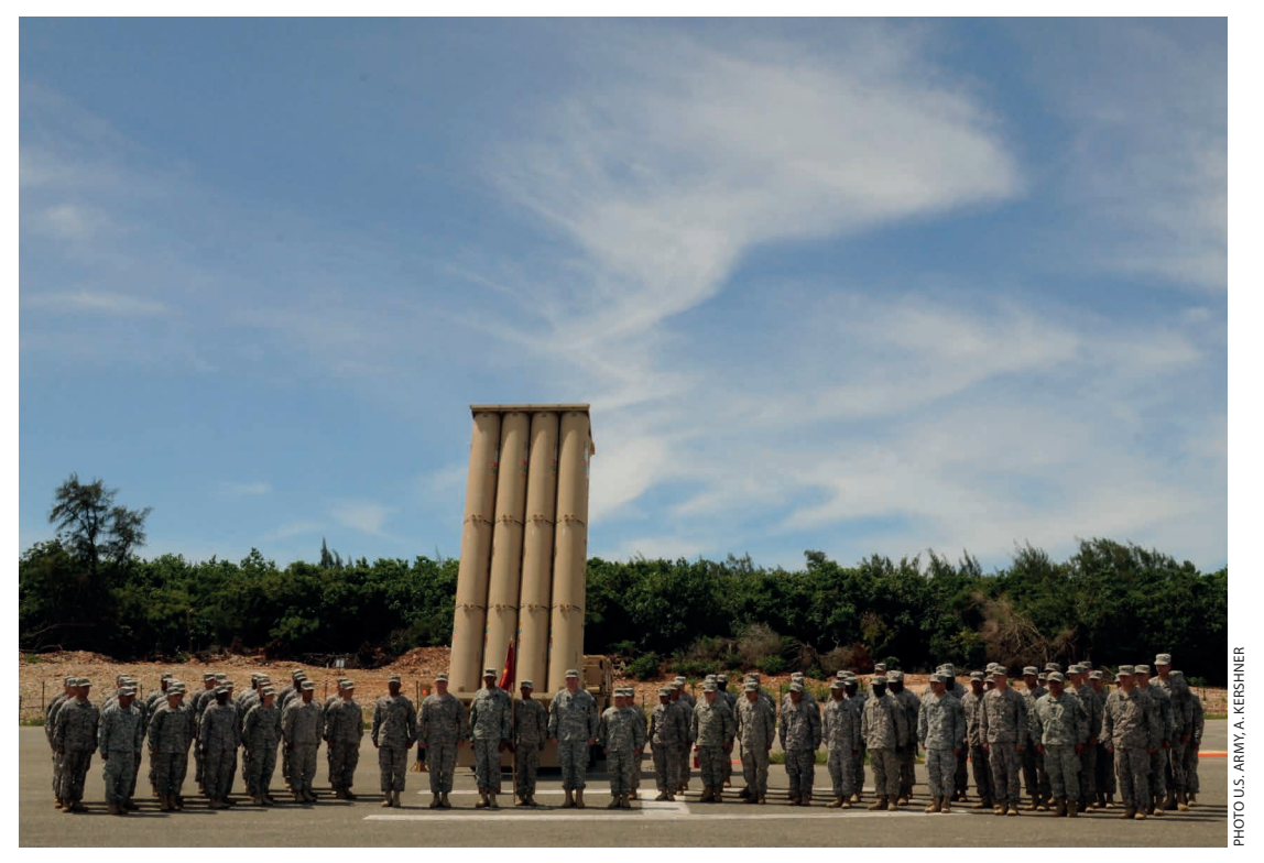
The A4 THAAD deployed to Andersen Air Force Base, Guam in April 2013 as a part of the 94th AAMDC Task Force Talon Mission

Department of Defense, provides the following definition of FMS, "The Foreign Military Sales program is the government-to-government method for selling U.S. defense equipment, services, and training. Responsible arms sales further national security and foreign policy objectives by strengthening bilateral defense relations, supporting coalition building, and enhancing interoperability between U.S. forces and militaries of friends and allies." 1