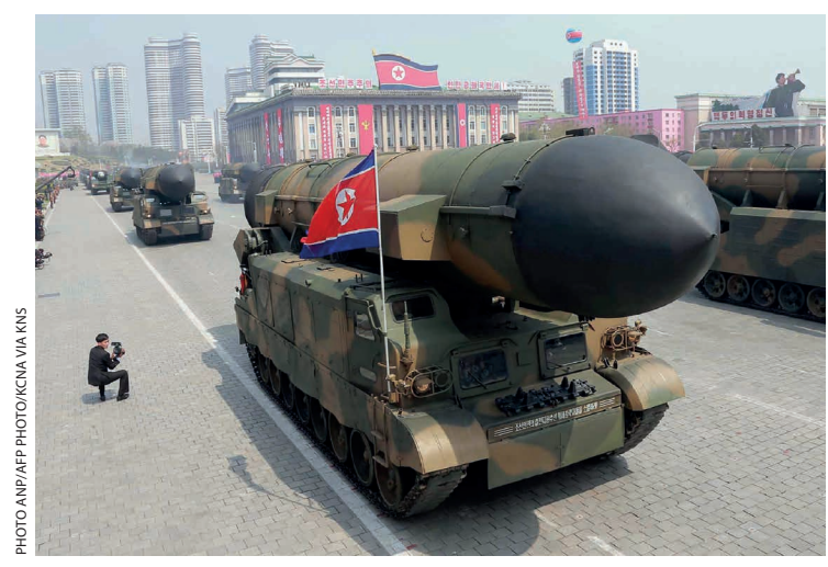
North Korea displays ballistic missiles during a military parade in the capital Pyongyang marking the 105th anniversary of the birth of the late leader Kim Il-Sung, April 15, 2017

research and development, shared costs, and more rapid fielding of new technologies. Additionally, long-term sustainment of the U.S. program reassures our partners that their own programs will have the benefit of continued U.S. support.