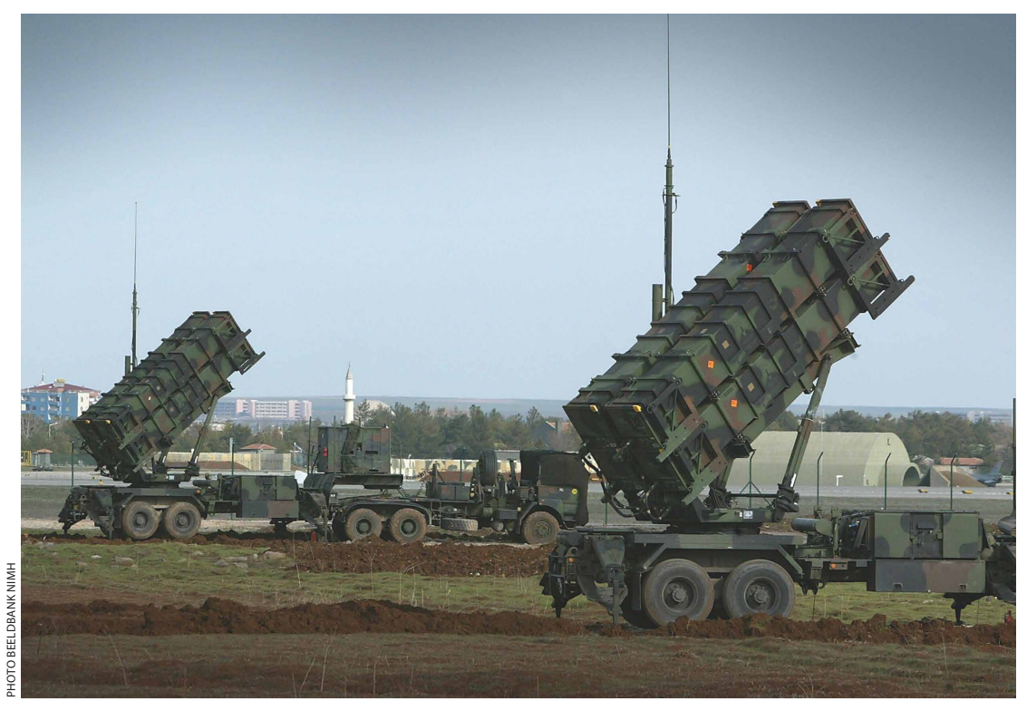
Patriot forces from the Netherlands were part of a multinational coalition that deployed to NATO partner Turkey in 2013

by both U.S. and Kuwaiti units. In just a little more than a decade after Desert Storm, the world no longer had to rely on untested and unproven technology as the best hope available. The new Patriot Advanced Capability three (PAC-3) missile, a kinetic, hit-to-kill missile system had been successful. More importantly, the world did not have to rely on U.S. air defenses alone to defend from ballistic missile attack. A new, combat-proven system was now available to a multinational force. The resolve of this new coalition would be tested time and again.