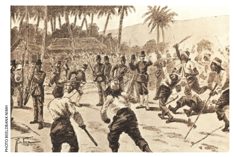
Fighting during the first military expedition to Aceh

The textual analysis shows that Commissary Nieuwenhuijzen was keen to stress the hostile attitude of the Sultan and the instability of the Sultanate as a threat to Dutch security in Northern Sumatra. The Oorlogsmanifest implies that without forceful means the Dutch colonial government would no longer be able to safeguard its own security in Northern Sumatra. In other words, the military expedition is just because it is launched in self-defence. According to Nieuwenhuijzen, it is the unwillingness and inability of the Acehnese Sultan to restore peace and order in his realm and his apparent preparations for war that provided the colonial government with a legitimate reason to use force. Moreover, Nieuwenhuijzen emphasises the righteousness of the war by stating that several