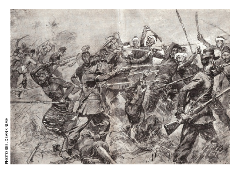
Heavy fighting between Dutch colonial troops and Acehnese warriors at the Mesigit during the first Dutch military expedition in Aceh

Despite the 1824 Anglo-Dutch treaty the Sultan tried to re-establish relations with an old ally, the Ottoman Empire, in 1868 by sending his most prominent adviser to Constantinople. The goal was to have the Ottoman Sultan declare Aceh a protectorate of the Ottoman Empire to rule out Dutch or British dominance. The diplomatic mission failed. With the Suez Canal completed in 1869 the most important shipping route to the Indies ran along the coast of Northern Sumatra. Thus control over the coast of Aceh became ever more important to the Dutch and British. In 1871 the Netherlands and