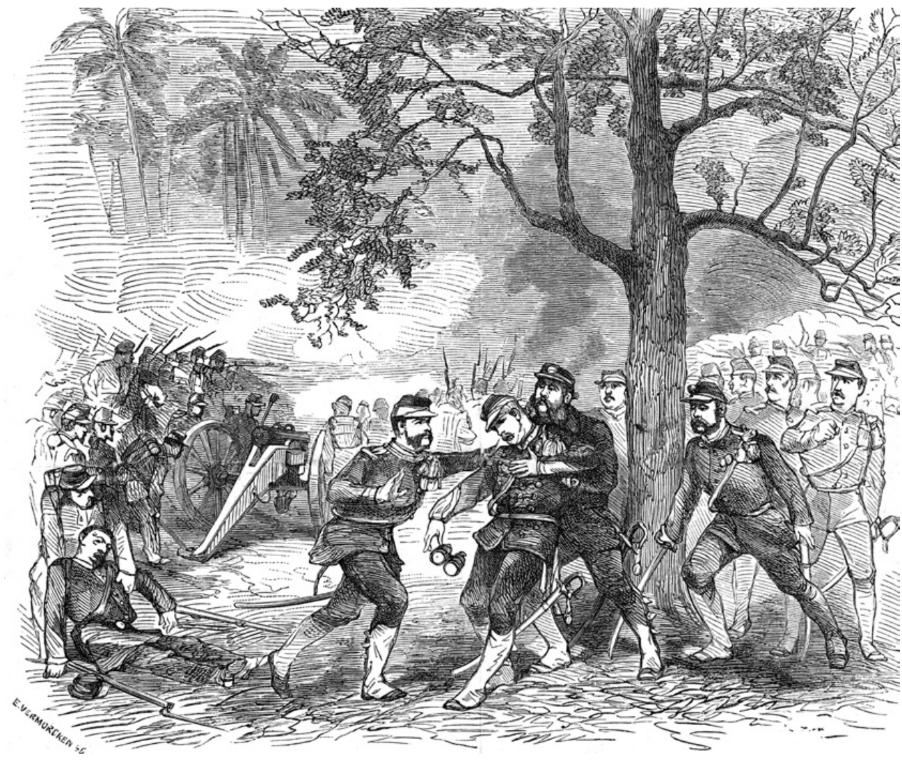
Major General Köhler, the commander of the first Aceh expedition, was killed during the fighting

are three types of 'units of security analysis' and three 'facilitating conditions' in order to confirm whether an issue is securitised or not.<sup>35</sup>