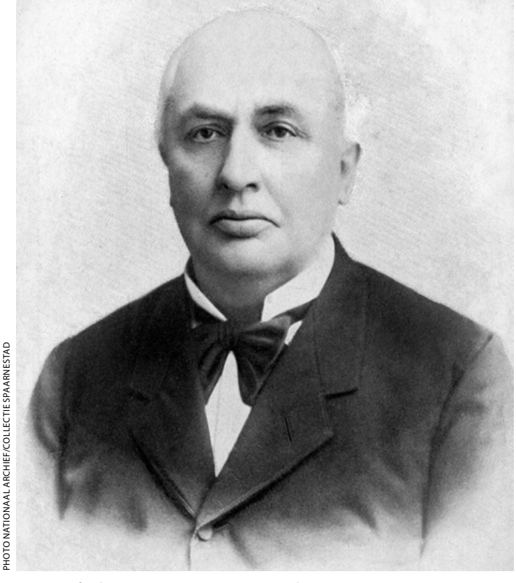
Minister of Colonies Isaäc Dignus Fransen van de Putte

The student of speech act theory is aware of the power of discourse in creating reality and moulding truth with words. Speech acts are 'forms of representation that do not simply depict a preference or view of an external reality but also have a performative effect.<sup>31</sup> A speech act invokes a truth by uttering what J.L. Austin