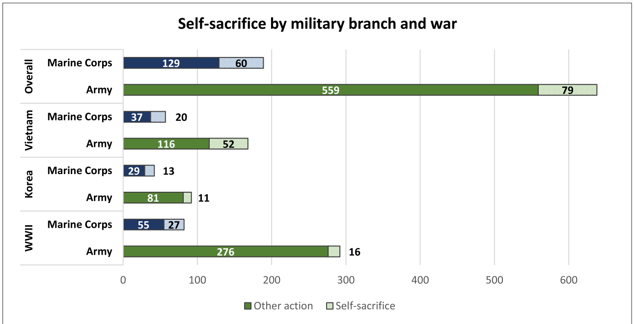
Figure 2 Number of MOH recipients serving in either Army or Marine Corps by war and in total; the shaded parts of the bars represent instances of self-sacrifice, solid parts represent all other actions

sis, this might be no coincidence, as Marines went through extremely tough recruit training together, which is likely to induce strong psychological bonds between them, resembling those between family members. 17