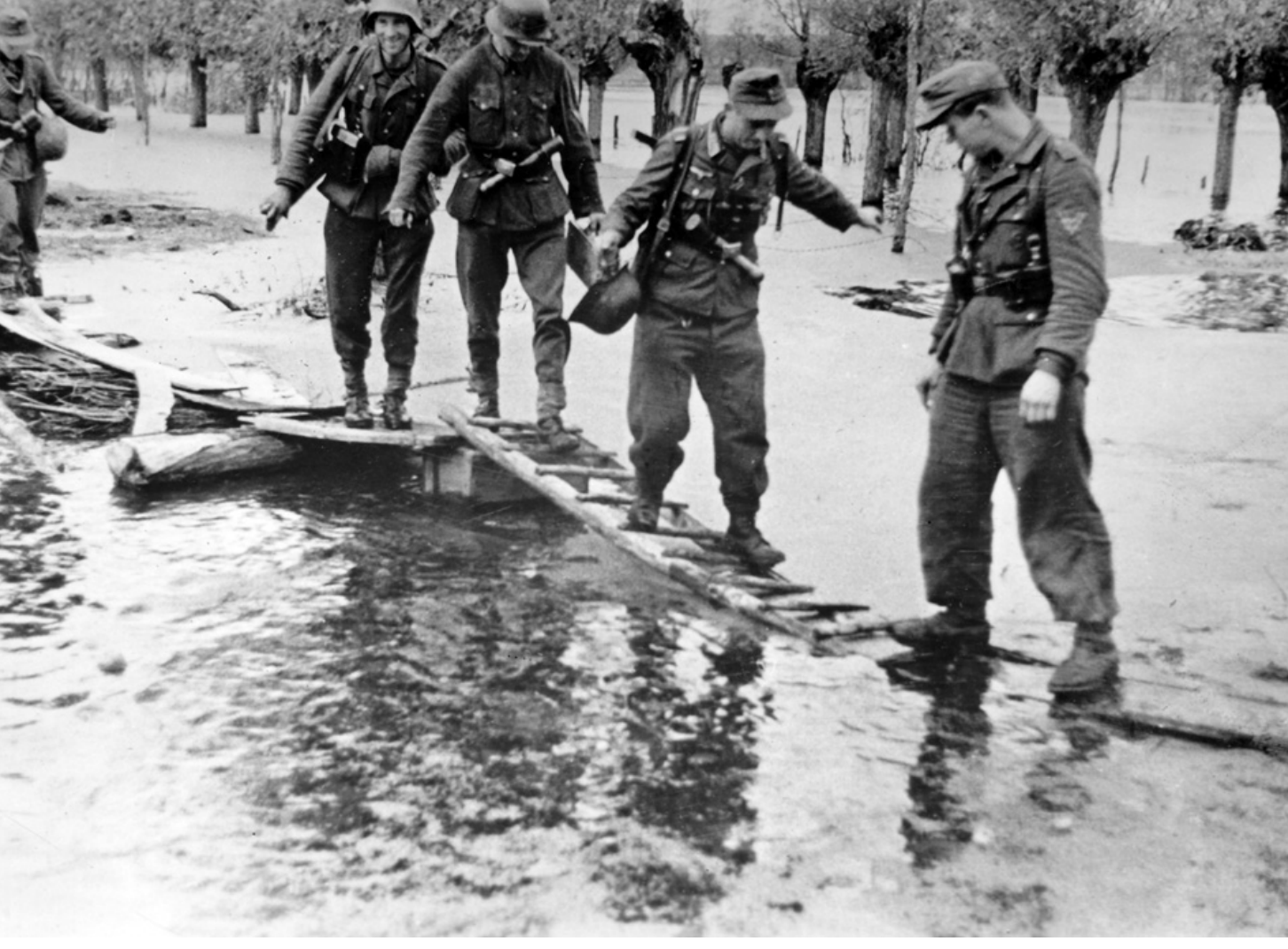
Nazi propaganda pictures showed the homefront how German troops continued operations in inundated terrain