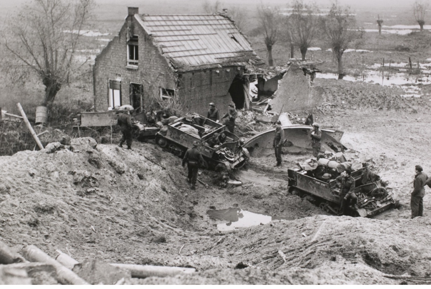
Canadian brencarriers plough through the mud near Breskens during the Battle of the Westerschelde