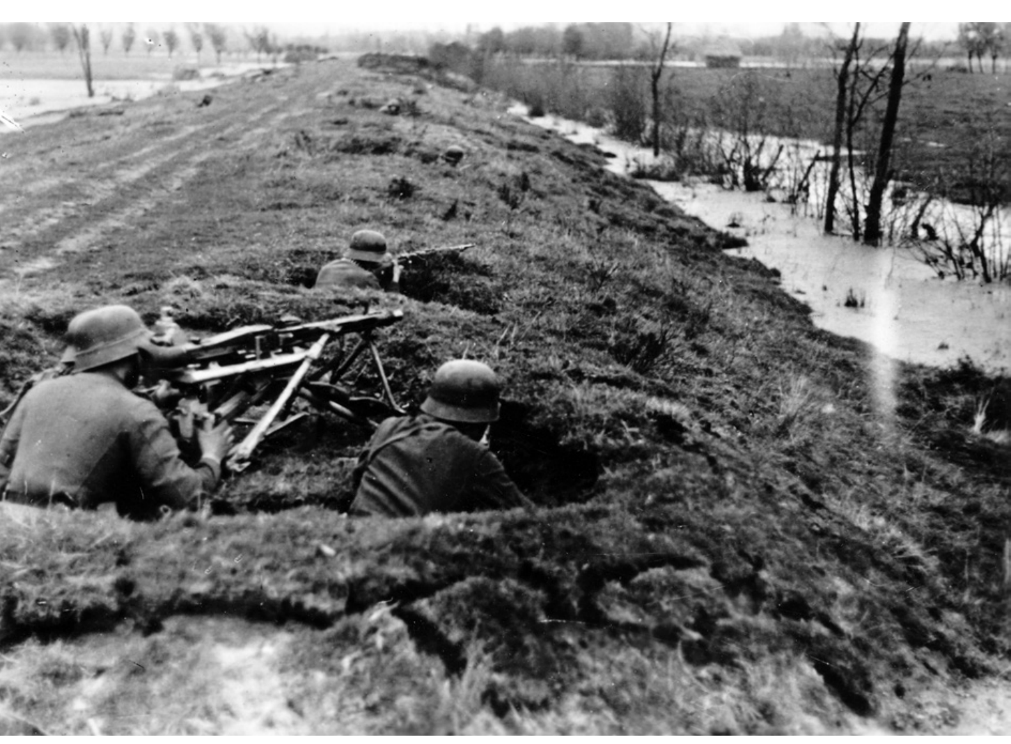
In inundated polders near the Leopold Canal the Allies met strong German opposition