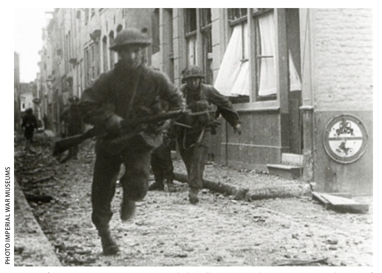
Due to fierce German resistance, it took the Allies over 48 hours to capture the city of Vlissingen and its harbour area

Using the dark of the night and approaching Vlissingen as silently as possible No. 4 (Army) Commando – part of the British 4<sup>th</sup> Special Services Brigade - landed at 'Uncle Beach' at around 05.45 hours on 1 November.<sup>38</sup> The area, to the east of the city's boulevard, had been chosen as the best landing zone on the recommendation of a Dutch police inspector, who had escaped Vlissingen a few days before. The initial landings went successfully, completely surprising the German defenders near Uncle Beach who were quickly overrun. Successive waves of No. 4 Commando Troops<sup>39</sup> went ashore despite German firing at the landing zone. The commandos entered the city, advancing through the centre. At its western side they had to halt their advance after arriving at the strategically located square codenamed Bexhill.<sup>40</sup> The Germans held the square under fire from a bunker at the landside of the boulevard. In the meantime the first of the three battalions of the 155<sup>th</sup> Infantry Brigade went ashore in the early daylight to support the No. 4 Commando Troops and capture other parts of the city. Soon, the 4<sup>th</sup> Battalion The King's Own Scottish Borderers was also bogged down at Bexhill (named 'Hellfire Corner' by the Scots). It took until the early morning of 2 November before the Germans in the bunker at the boulevard surrendered after French commandos had finally reached the front entrance. On the same day the 5<sup>th</sup>