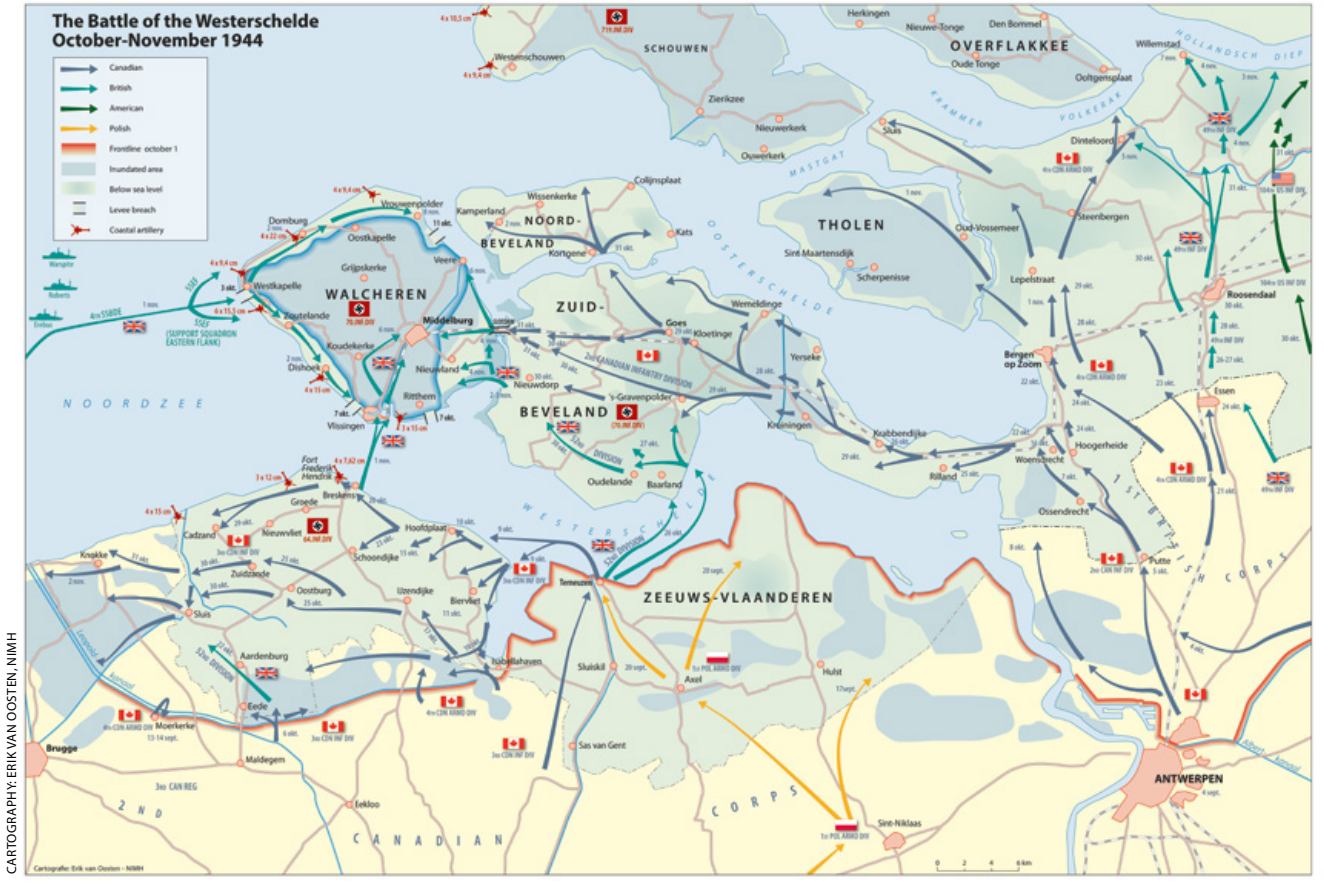
Map 1 Overview of the Battle of the Westerschelde, October-November 1944

open the Westerschelde waterway was delayed.<sup>8</sup> In the meantime the planning of the Battle of the Westerschelde was underway.