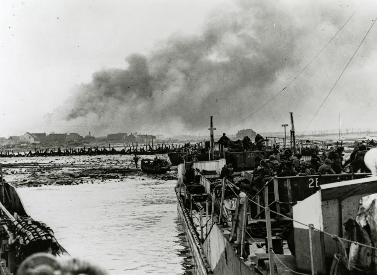
A landing vessel with British commando's of 47 RMC and a Dutch unit approaches Westkapelle, 1 November 1944