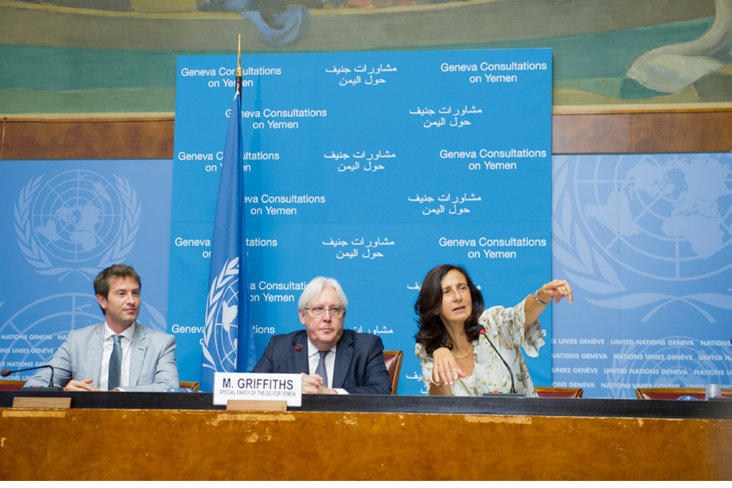
At the Geneva Consultations on Yemen in September 2018, amongst other subjects the character of the intervention in the country was discussed