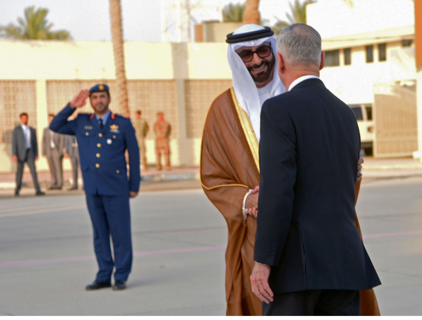
Former U.S. Secretary of Defense James Mattis is welcomed by his United Arab Emirates collegue Mohammed bin Rashid Al Maktoum; together with Saudi-Arabia, Qatar, Kuwait and Bahrain, the UAE has argued for the need for collective self-defence

military exercises near the Saudi border does not constitute an instant, overwhelming threat that leaves no moment for deliberation and no choice of other means. Thus, according to Just War Theory, the Saudi-led coalition cannot claim pre-emptive self-defence for intervening in Yemen.