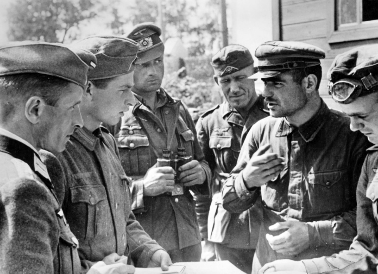
According to nazi propaganda, the pictured Kommissar gave abundant information about positions of the Soviet army after he was captured in August 1941