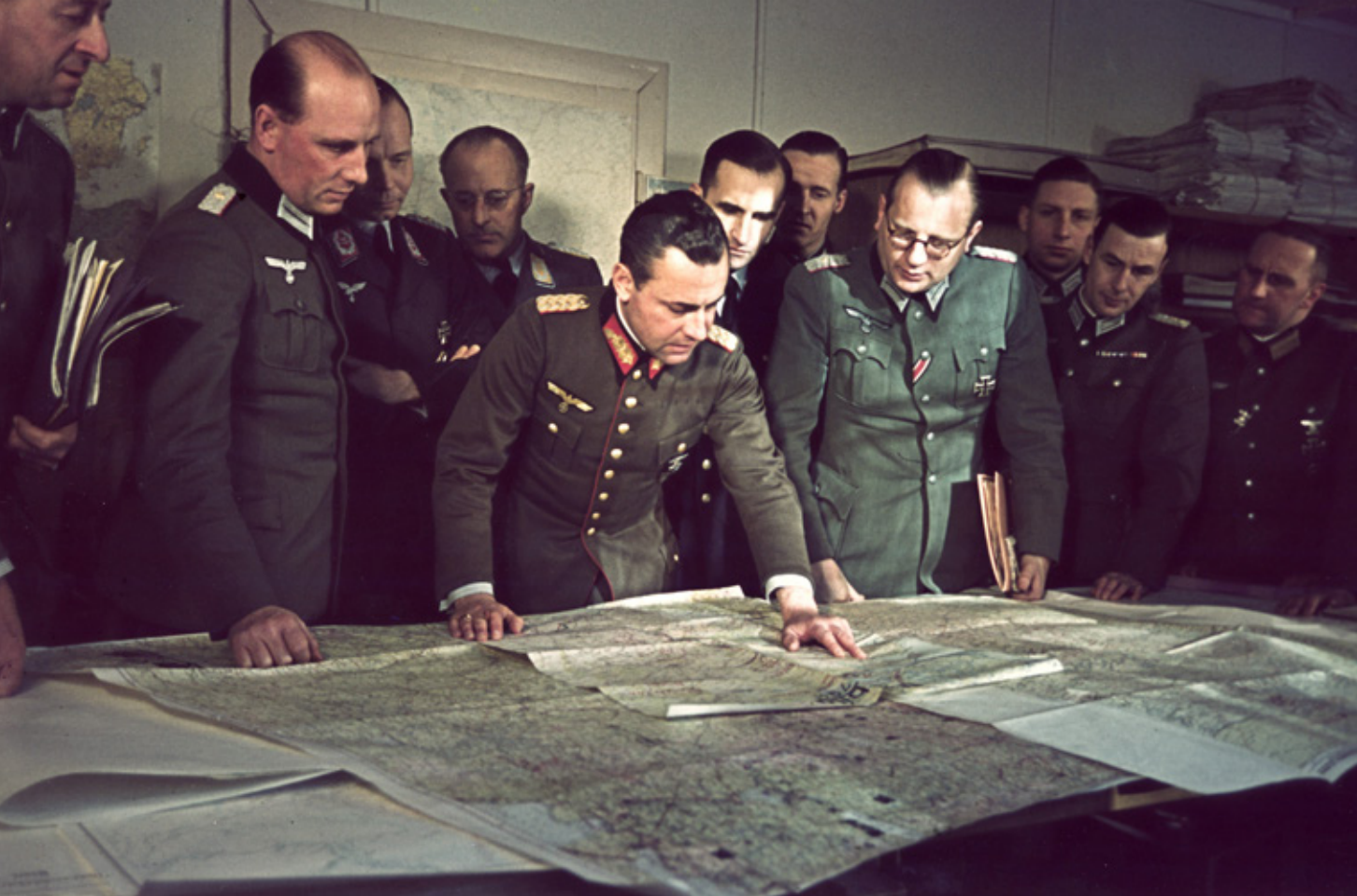
Walter Warlimont (centre) with officers at the Führerhauptquartier Wolfsschanze, ca. 1942-1943