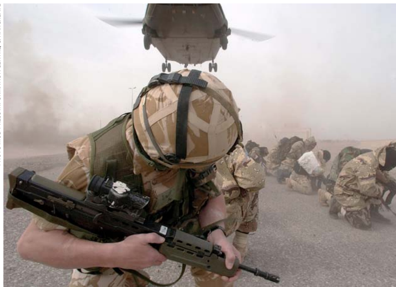
Basra, Iraq, 2005. A Chinook lands to pick up the Air Reaction Force (ARF) on a routine vehicle check point patrol. The British troops supported the Iraqi elections by providing security on an outer cordon which was manned by the Iraqi Police