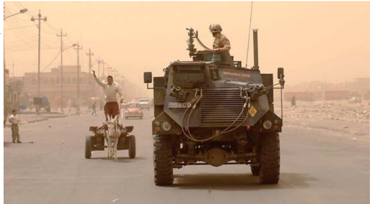
A routine patrol of Al Hayyaniya in the south of Iraq, to maintain law and order and improve relationships between the local community and coalition forces.