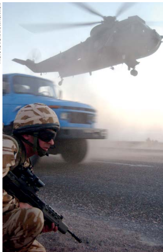
Looking out for anyone trying to smuggle oil, weapons and even people, with kidnappings on the increase in the area of Basrah.