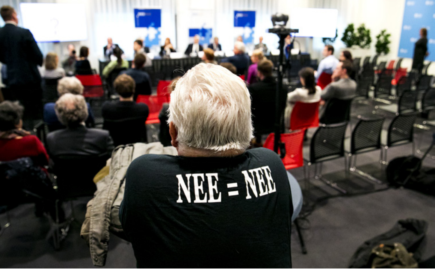
Statement by an attendee at the announcement of the advisory referendum on the Wiv in 2018: the level of public support restricts the scope of NLD DISS's activities