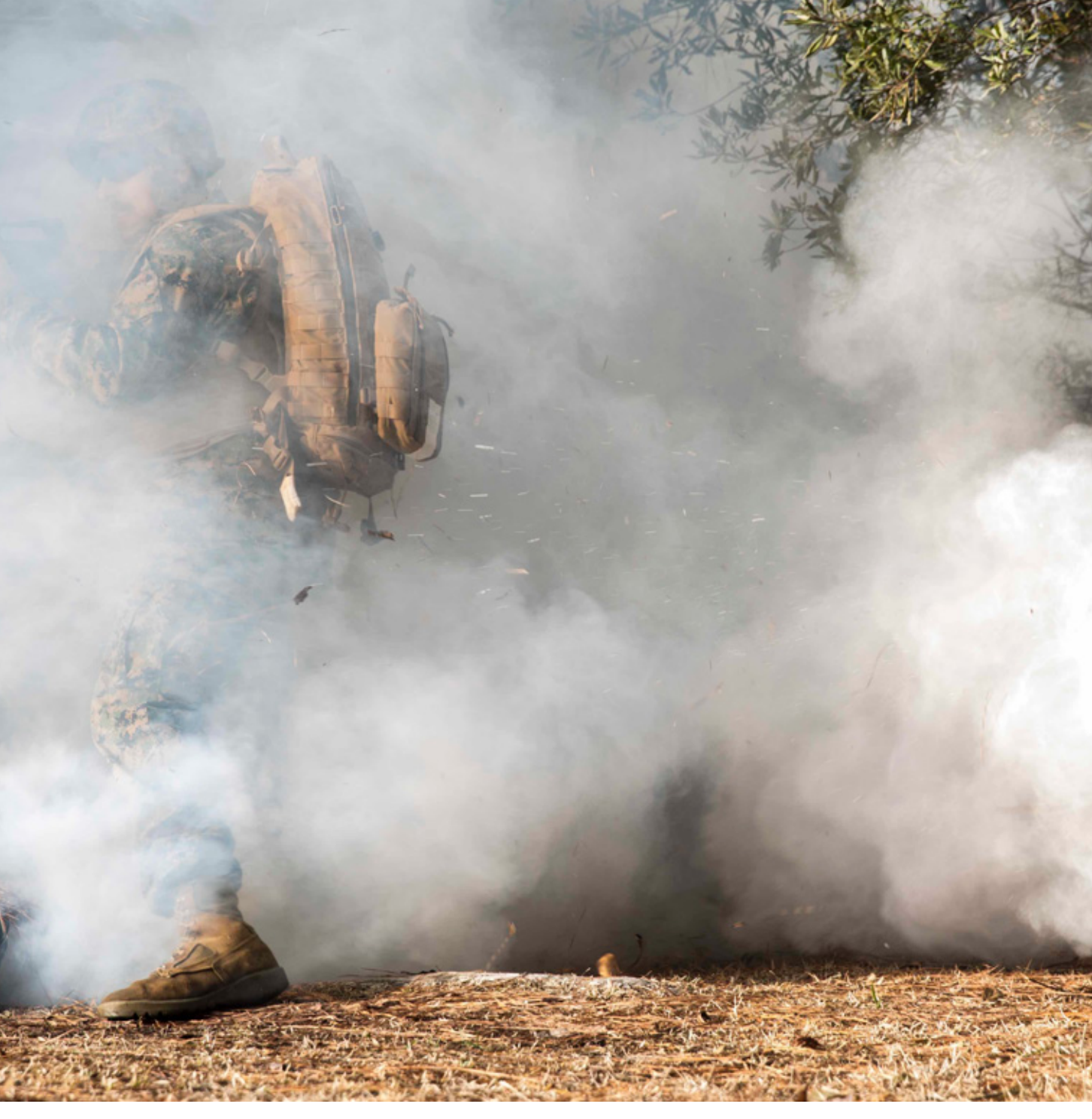
The smoke machine takes on a metaphorical significance as the intelligence community gradually shifts towards the Clausewitz approach, which posits that the current circumstances are so complex that the fog of war will never lift completely

future is that it will be different, '49 and faced with such uncertainty I&S services will need to be optimally prepared for an unknown future.