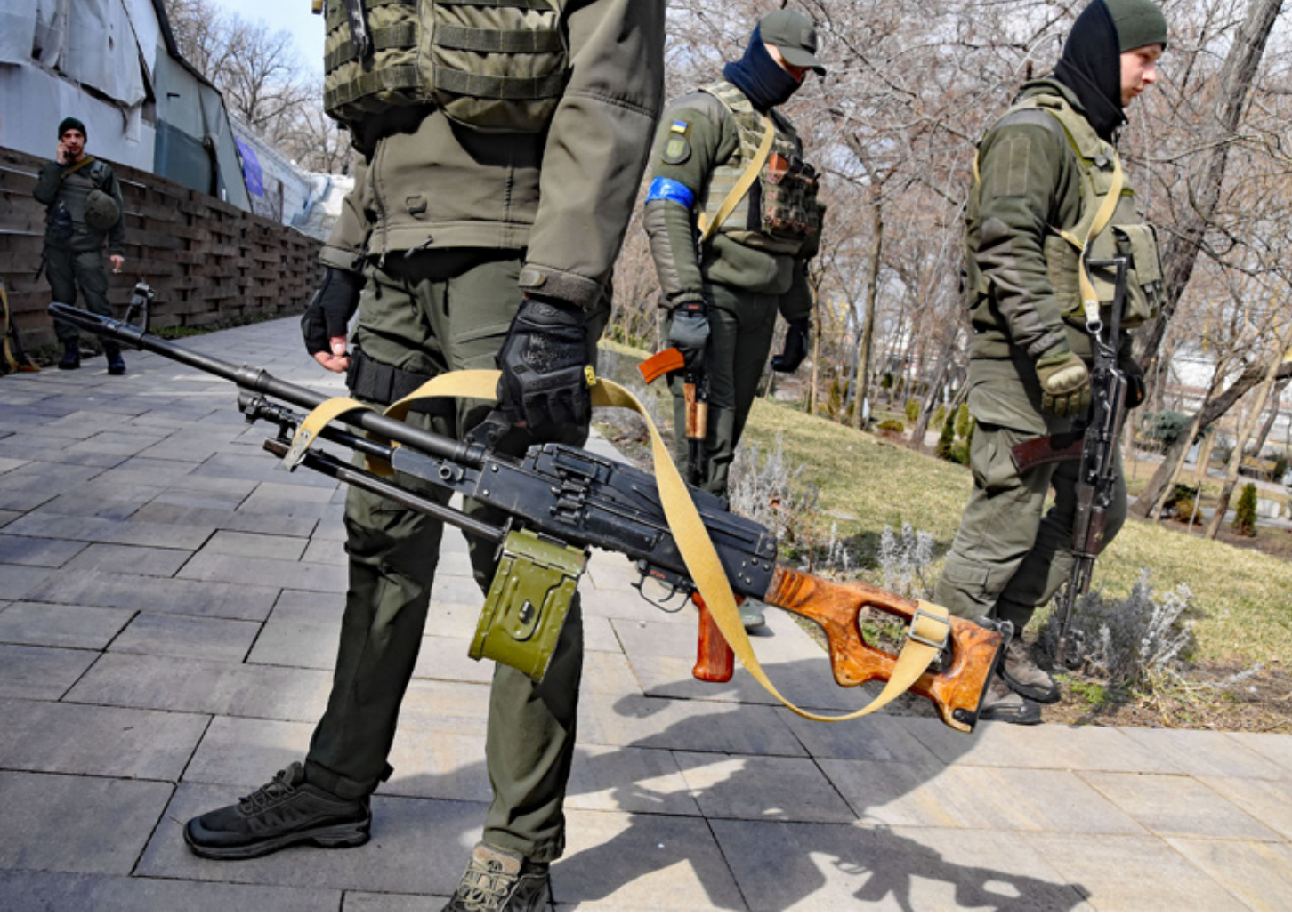
Contradictory reports on the conflict in Ukraine hamper interpretation of the large volume of data in circulation