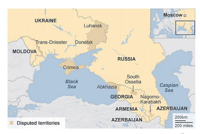
Map 1 Russian occupied areas, or areas with Russian peacekeepers since 1991<sup>17</sup>

The current military operation in Ukraine is part of Russian operational art and fits within a framework that was developed for operations in