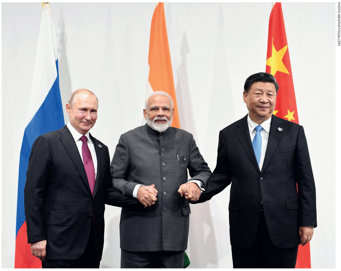
Russia-India-China trilateral meeting between Indian Prime Minister Narendra Modi (centre), President of Russia Vladimir Putin and President of China Xi Jinping. In the 'escalation' phase, between 2015 and 2021, Russia strengthened its international coalition with, among others, China and India

exercises there.<sup>43</sup> At the same time Russia stepped up its information operations towards Ukraine, the international community and the Russians at home. To justify its cause, Russia intensified diplomatic pressure and propaganda to the world community about alleged Ukrainian ceasefire violations in the Donbas and accused Ukraine of committing genocide on Russian citizens in that area. As in previous conflicts, Russia compared the Ukrainian government and its allies to the Nazis in order to further justify its cause.<sup>44</sup> Besides, Russian media showed Ukrainian forces with swastikas