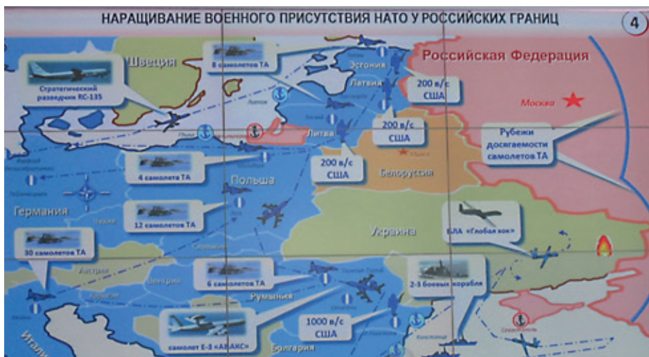
Figure 3 During a presentation in 2015, Deputy Chief of the General Staff Kartapolov visualized the perceived threat of Western air power to the Russian homeland 32

The final design principle facilitating interdiction is radio-electronic warfare, which aims to achieve effects in the electromagnetic spectrum. 33 The Russian General Staff views information support to NATO military units as crucial to its fast-paced, high-technology style of warfare. 34 As a result, they have developed a doctrine that anticipates disrupting NATO command and control nodes to slow force projection and operational tempo. 35 Some of the modern Russian radio-electronic warfare systems can jam, disrupt, spoof, suppress, or intercept signals from satellites, radars, communication systems, and precision munitions guidance systems. Indeed, after analyzing Operation Desert Storm, Russian observers noted that space-based systems were ‘the basis of all technical reconnaissance’ during the war. 36