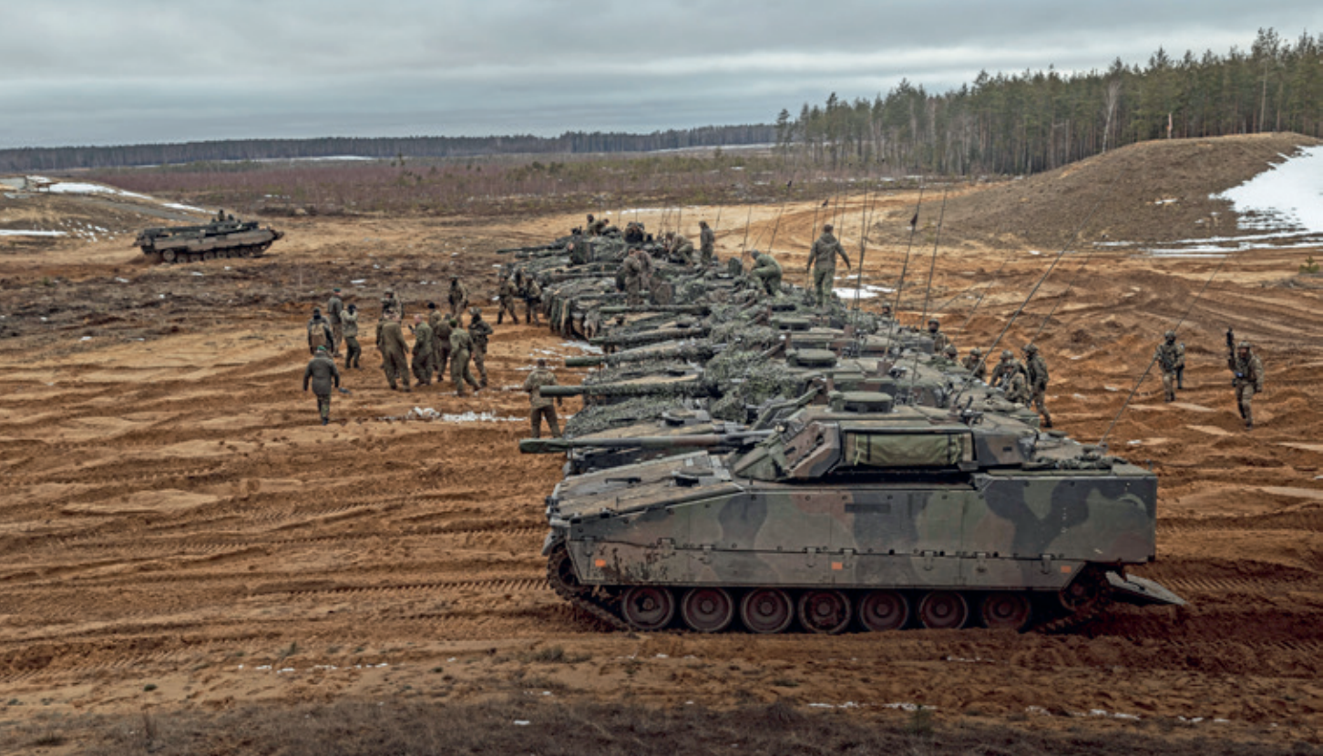
The Dutch 43 Mechanised Brigade, part of the enhanced Forward Presence in Lithuania. NATO should re-think force projection conceptually and prioritize rail, road, and inland waterway movement

cruise missiles to long distance missiles. The SA-21 and SA-23 SAMs can fire 40N6 missiles that can potentially engage targets at 400 kilometres. Although targeting fighter aircraft at such a range is challenging, it puts less agile aircraft like AWACS at risk. 47 In addition, Russian and Belorussian Army brigades and regiments have short- and medium-range air defence systems to maneuver with, further strengthening the IADS. Indeed, forward-deployed ground forces within a Russian Baltic Sea region concept of operations increase the depth of the IADS, putting NATO air operations at high risk during the initial weeks of a military conflict.