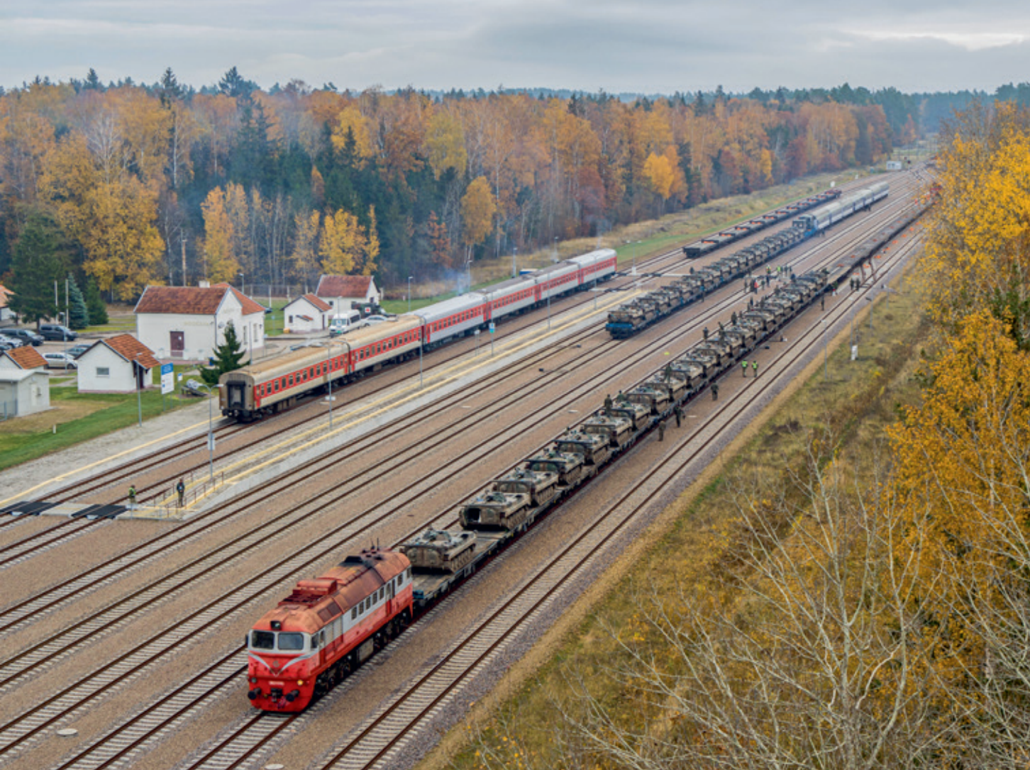
Polish Army BMP-1 Infantry Fighting Vehicles at the Lithuanian rail yard of Mockava during exercise Brilliant Jump 20, designed to test the deployment time of NATO's Very High Readiness Joint Task Force