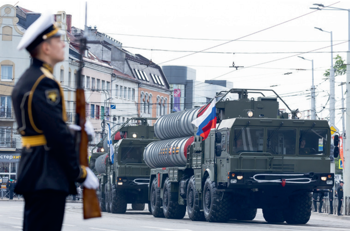
Russian show of force in Kaliningrad during the May 9, 2024 military parade dedicated to the 79th anniversary of Victory in the Great Patriotic War

9M729 poses a challenge for NATO targeting. 38 Targeting critical infrastructure is a fundamental premise of Russian operational planning, as regularly demonstrated by the General Staff in Ukraine. Disrupting the reception of the RSOI process with salvos of cruise and ballistic missiles is a realistic response option when Moscow deems war with NATO as inevitable.