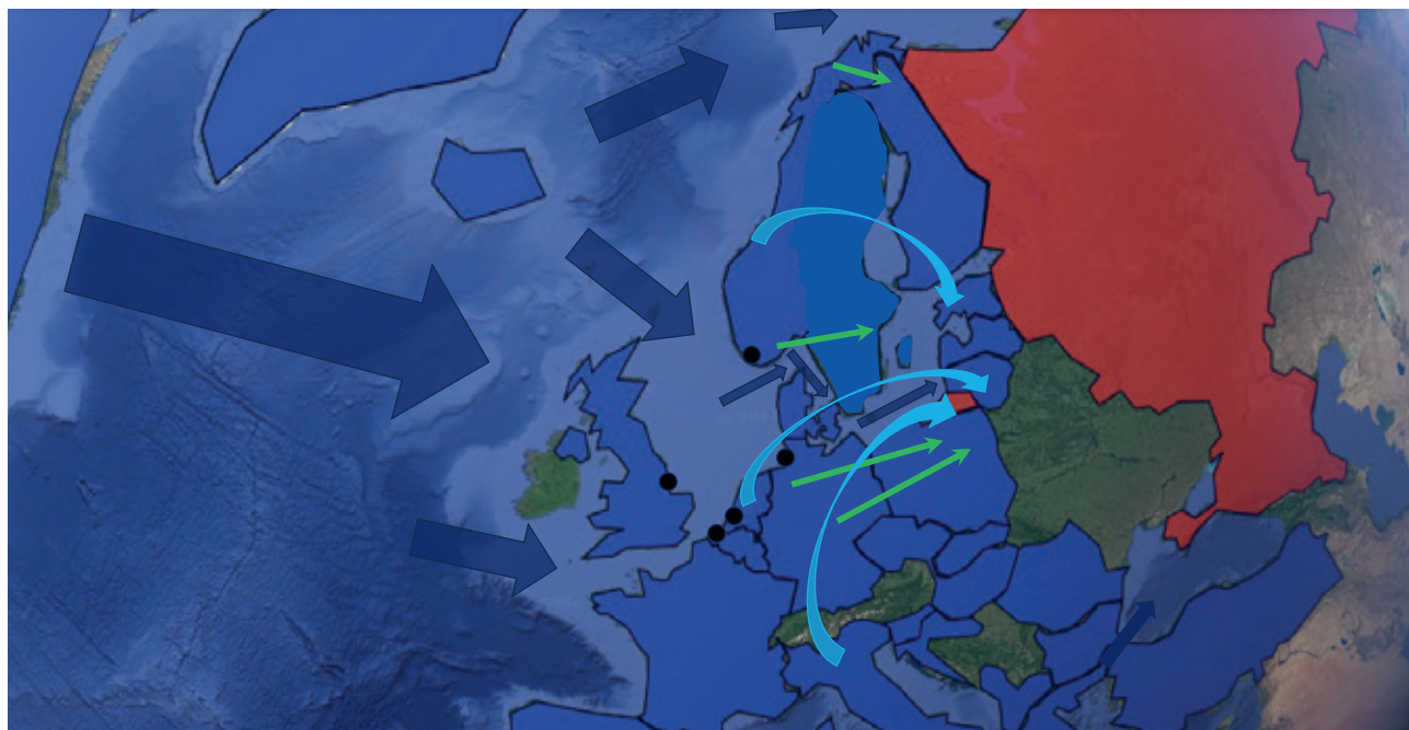
Figure 2 Visualizing force projection in the Baltic Sea region enhances the comprehension of the vast scope of the operation

extensive that it constitutes a sophisticated operation in itself.