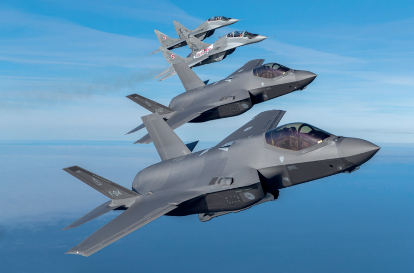
NATO fighters during an air policing mission over Poland, 2023. The F-35 is well suited for SEAD/DEAD operations