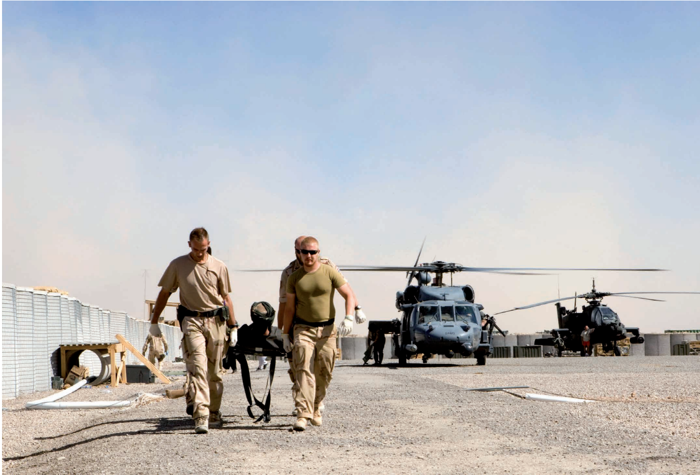
The Netherlands participated in ISAF with Task Force Uruzgan (TFU), and were lead nation in Uruzgan province between 2006 –2010. In the role 2 hospital medics took also care for the Afghans, like members of the Afghan police

risk factors and populations at risk, and in evaluating efficiency of delivered care. 8 However, the development of reliable conclusions and recommendations requires the universal use of clear and unambiguous casualty definitions (see figure 1).