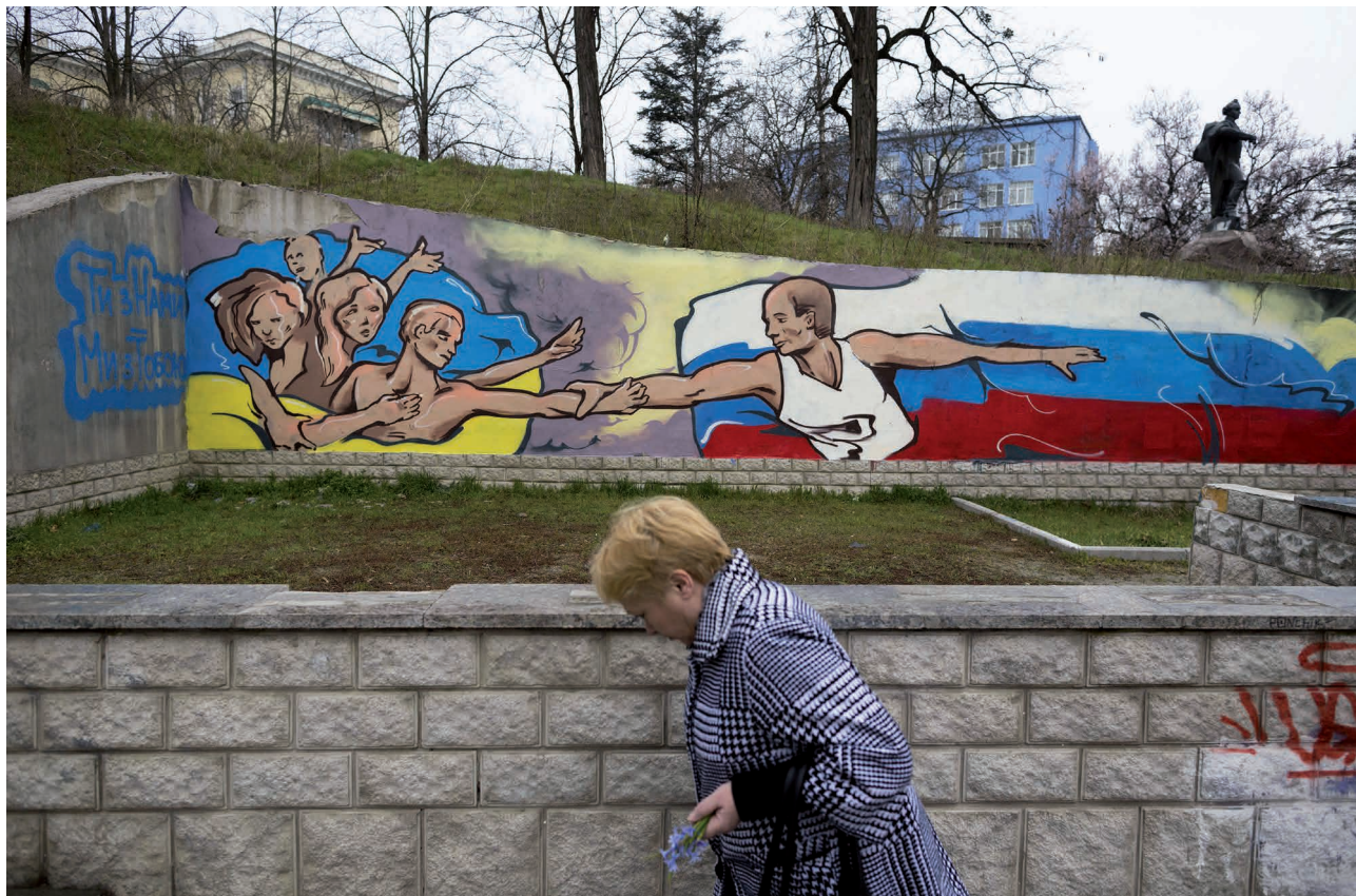
A woman passes a wall painting in Simferopol, Crimea, depicting President Putin reaching out to ethnic Russians living in Ukraine (March 2014)

Developments in the information domain contributed to this dominance. In 2010, Russia established social media groups such as the Kremlin School of Bloggers to support their